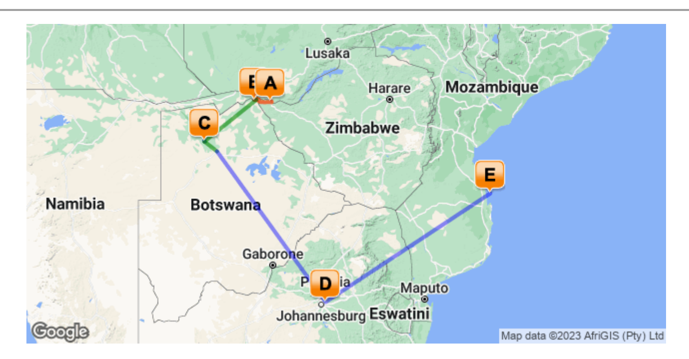
Click here to view your Digital Itinerary

Zambezi National Park - Chobe National Park - Okavango Delta - Johannesburg - Bazaruto Archipelago 13 Days / 12 Nights