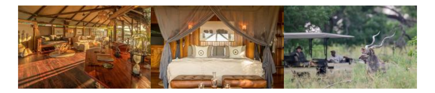
Day 7 African Rock Hotel & Spa, Johannesburg