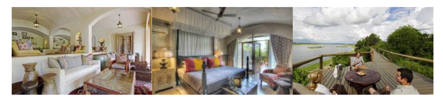
Day 5-7 Kanana, Okavango Delta